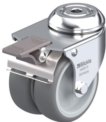
Corresponding standard locking LMDA-TPA 75G-FI