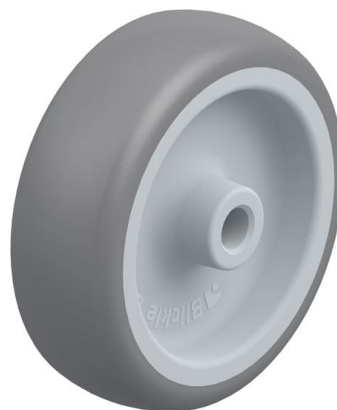
Wheel used TPA 75/8G