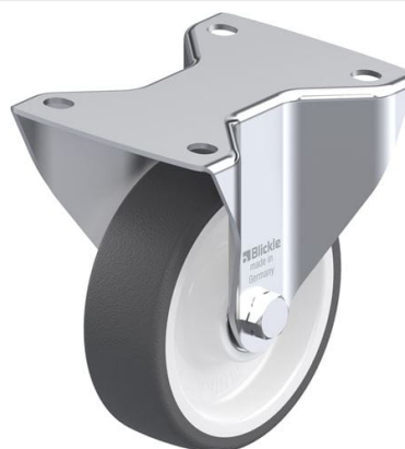
Corresponding rigid caster BK-POTH 125KA-3