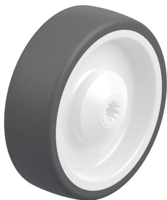
Wheel used POTH 125/10KA