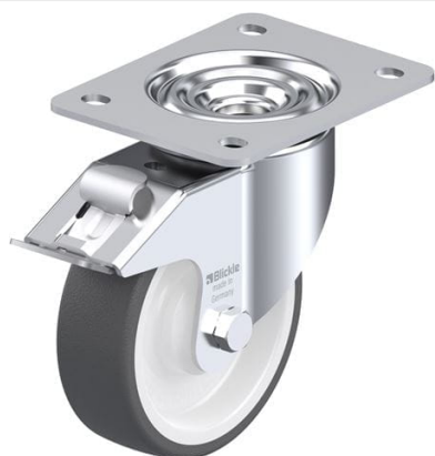
Corresponding standard locking LK-POTH 125KA-3-FI