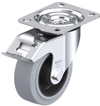
Corresponding standard locking LE-POEV 100R-FI-SG