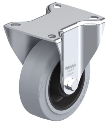
Corresponding rigid caster B-POEV 100R-SG