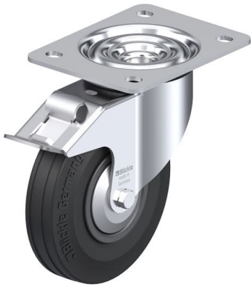
Corresponding standard locking L-VPP 140G-FI-FA