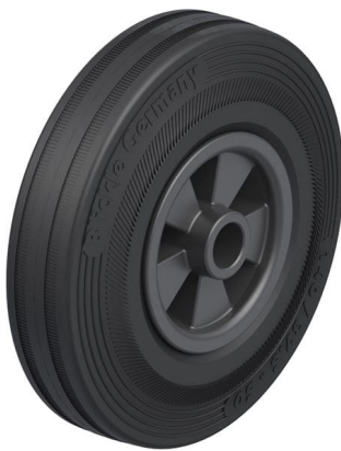
Wheel used VPP 140/15G