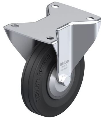
Corresponding rigid caster B-VPP 140G-FA