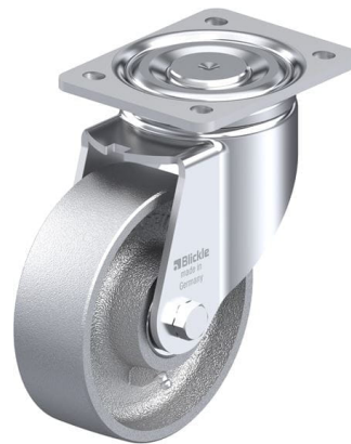
Corresponding swivel caster LH-G 150K