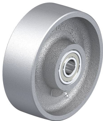
Wheel used G 150/20K