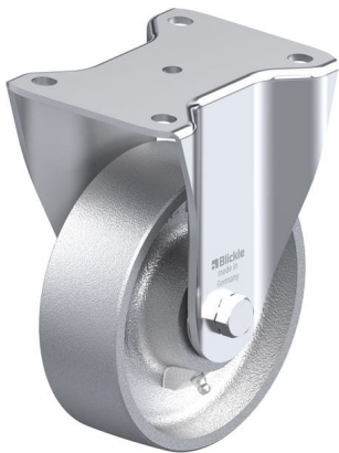
Corresponding rigid caster BH-G 150K