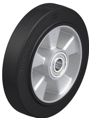
Wheel used ALEV 200/20K