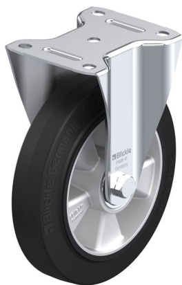
Corresponding rigid caster B-ALEV 200K