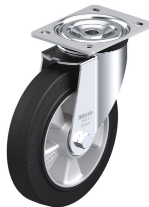
Corresponding swivel caster L-ALEV 200K