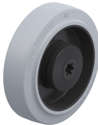
Wheel used POEV 160/12KA-SG