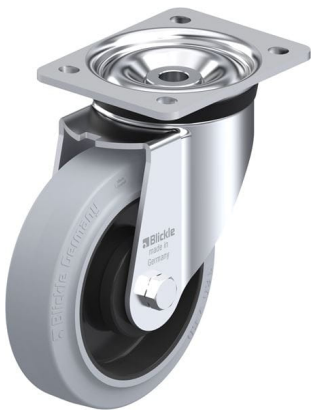
Corresponding swivel caster LK-POEV 160KA-SG