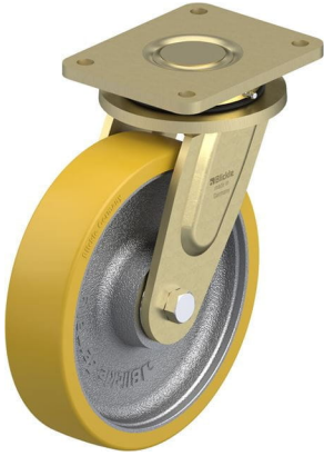
Corresponding swivel caster LS-GTH 250K