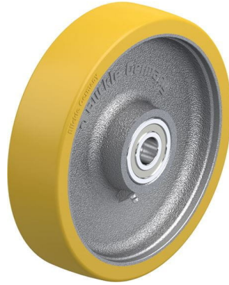
Wheel used GTH 250/25K