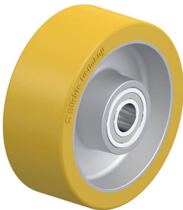
Wheel used ALTH 100/15K