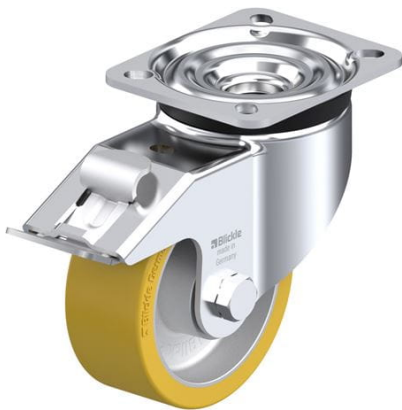
Corresponding standard locking LK-ALTH 100K-1-FI