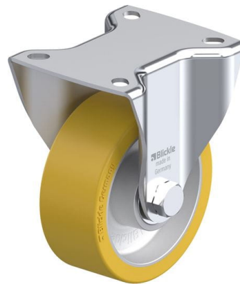
Corresponding rigid caster BK-ALTH 100K-1