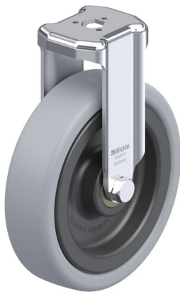
Corresponding rigid caster BKRA-VPA 126K