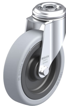
Corresponding swivel caster LKRA-VPA 126K