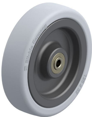
Wheel used VPA 126/8K