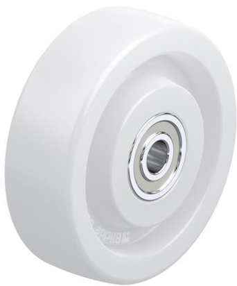
Wheel used SP0 125/15K