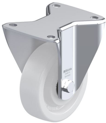
Corresponding rigid caster BH-SP0 125K-3