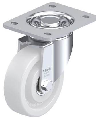
Corresponding swivel caster LH-SP0 125K-3